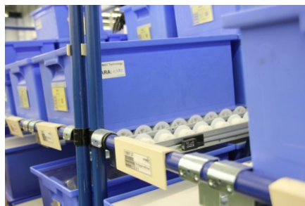
The sensor fitted to the FIFO rack ensures complete transparency of stock levels

These questions have also been concerning SCHMIDT Technology. The company manufacturing process calls for sub-components to be manufactured according to a defined production plan resulting in the assembly of the finished product – “we don't manufacture parts for stock” comments Production Manager Ulrich Heck. “The question of whether there was too much or too little stock of components in was fundamental in establishing the degree of transparency in the logistics process.”