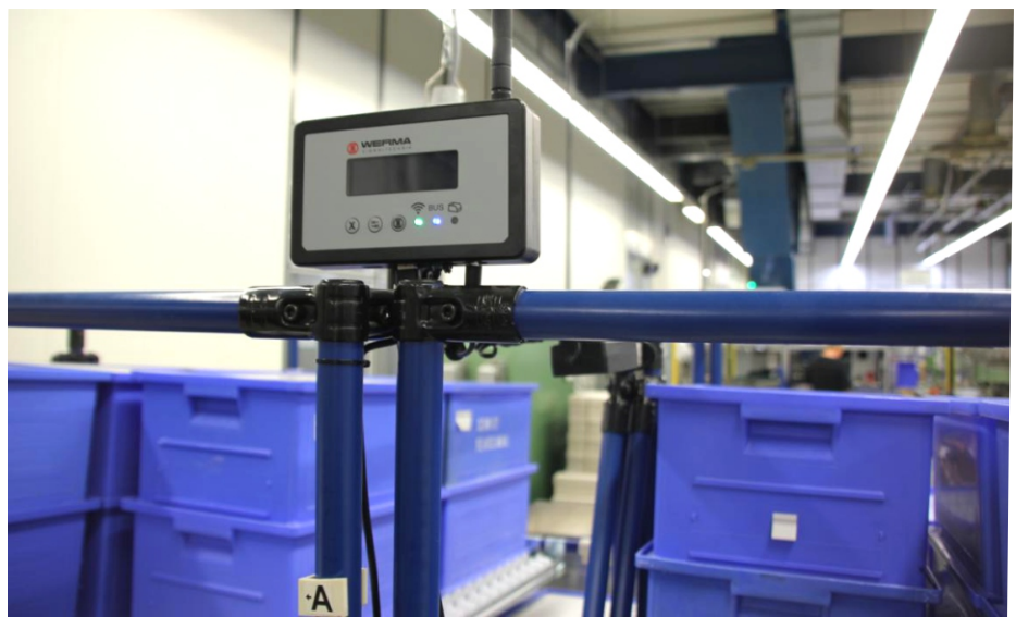
The SmartBOX transmits the data collected by the sensors wirelessly

StockSAVER offers a robust error-free system as it is no longer necessary to scan withdrawals of stock neither is there a danger of duplicate bookings being made nor are arithmetically calculated stock level errors possible.