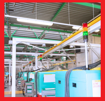
Each machine already had a WERMA signal tower, which was quickly and easily kitted out with a SmartMONITOR module.