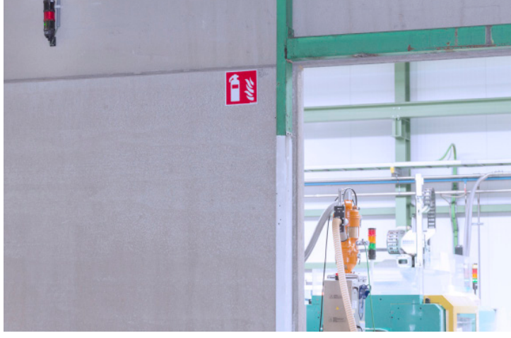
Image, left: A signal tower in the canteen indicates whether there is a machine fault, and, if so, in which area of the workshop.

Image, right: A problem up to now: The solid wall between the two workshops prevented seeing if machines were not working as planned. The wireless monitoring system was able to provide complete transparency of all of the areas of the workshop.