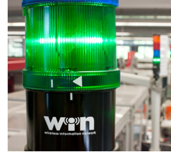
TRW Blumberg has been using WERMA signal towers for years and thereby ensures simple and effective machine monitoring and transparency in Production.

TRW has become an exemplary user of the WIN system giving much valuable feedback to the WIN development team. In this way modifications and new ideas to the product hardware and software can be introduced quickly.